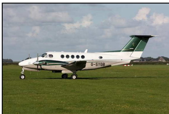
A special visitor was the PH-4G6 (on 24th July). The Slovenian-built aircraft is registered as an ultralight but has the characteristics of a motorglider. On 3rd September Synergy Aviation flew a charter from London to Texel. After staying two days the Beech King Air 200GT made the return flight.