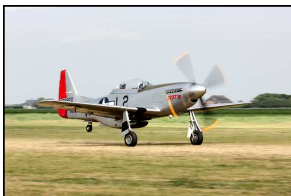
In addition to the PH-ECC, N212LT, HB-FOY, OY-SCI and PH-XII, the PH-SOE was the 6th Pilatus PC-12 to visit Texel, on 21st June. It was five years ago that we last saw a P51 Mustang at Texel. The PH-VDF came on 29th and 30th June.