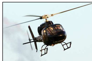
OK-PEK, TB-10 (9/9)