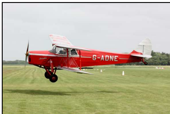
2-6-2010: For the very first time: a TBM850 at Texel Airport! Right: This Hornet Moth was built in 1936 and was on it's way to the North Cape!