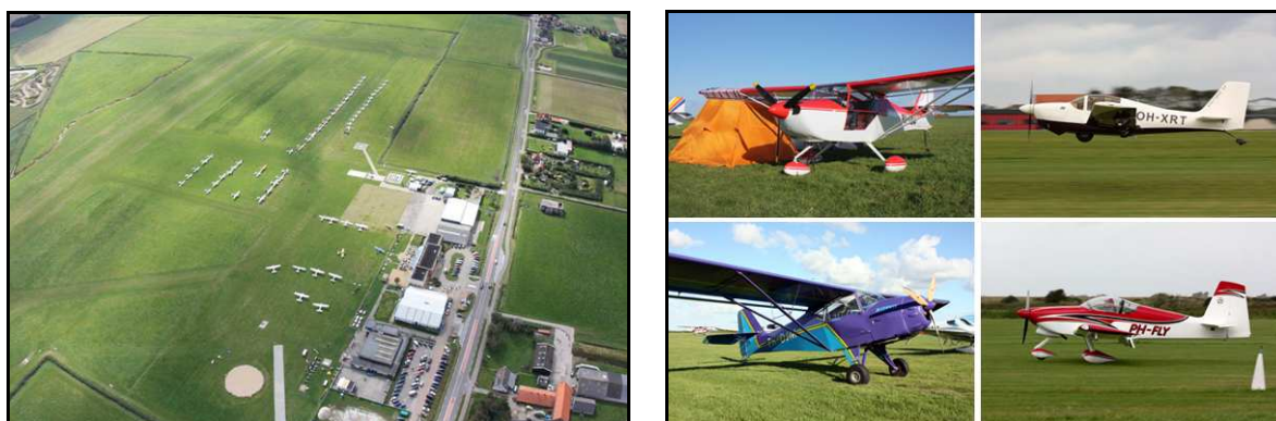
Photos of the successful 2010fly-in.

If you have any tips for the fly-in, contact us via the site www.flyin.nl !